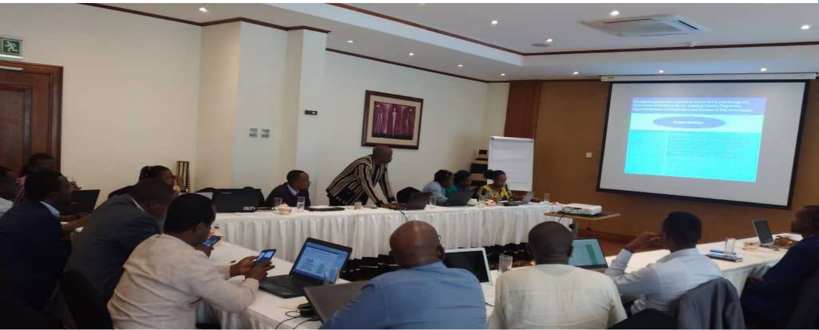
Photo: Stakeholders from various government institutions, NGOs, Private sectors during the workshop