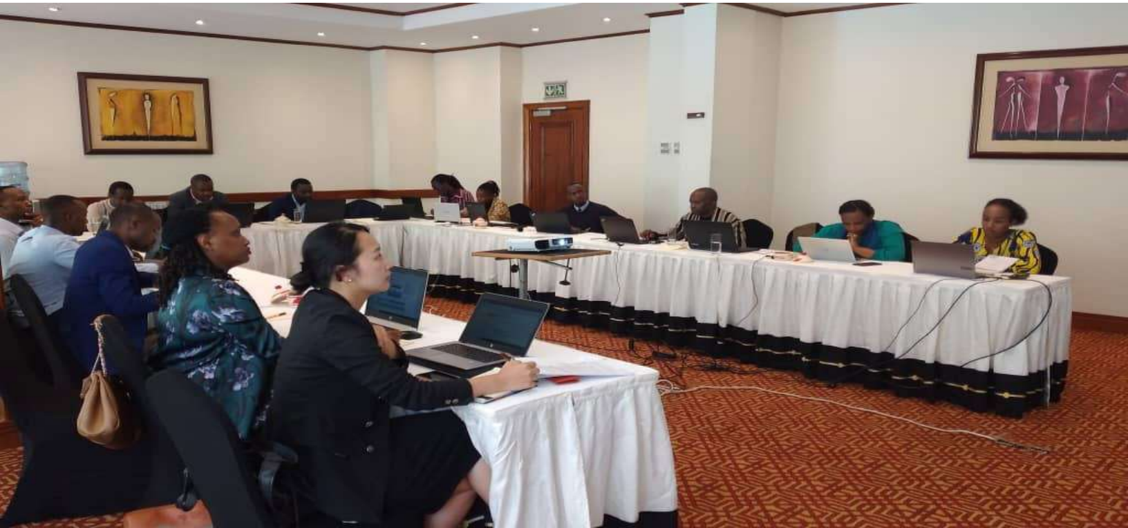
Photo: NCT Members assessing project proposal submitted by AFC

the GCF on the updated Country Programme and Strategic Framework, thereafter, participants joined different groups in sections and started addressing the GCF comments related to the Country Programme and Strategic Framework.