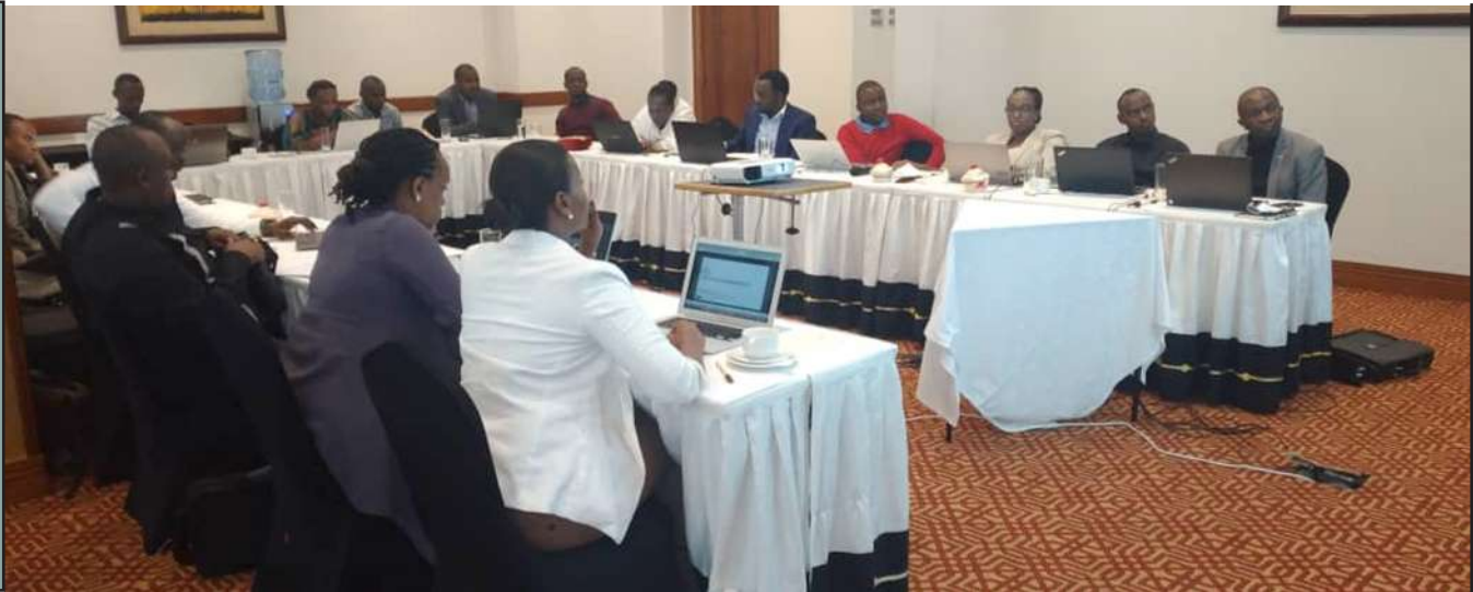
Photo: Stakeholders during discussion in plenary session of the workshop

The Green Climate Fund (GCF) is the financial mechanism created from parties initiative within the United Nations Framework Convention on Climate Change (UNFCCC) which mandated to support developing countries including Rwanda to respond to the challenge of climate change, and seeks to promote a paradigm shift to low-emission and , climate-resilient development, considering the needs of nations that are particularly vulnerable to climate change impacts.