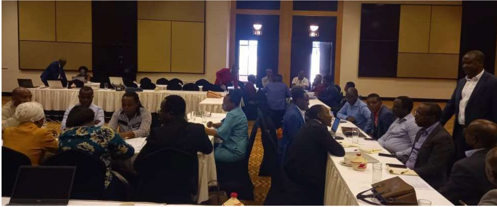
Photo: The participants in group discussion during inception workshop

The unique expertise of the private sector, its capacity to innovate and produce new technologies for adaptation, and its financial leverage can form an important part of the multi-sectoral partnership that is required between governmental, private and non-governmental actors.